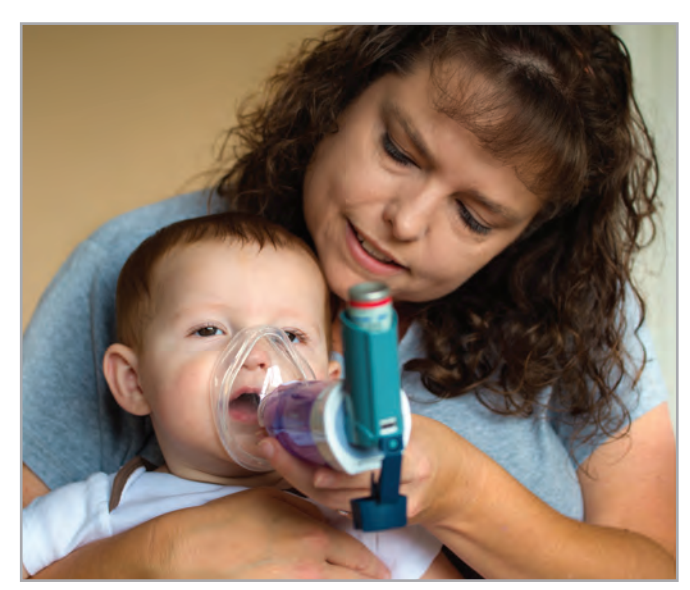
Administering quick-relief medication